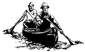
Our unique COVER PHOTO was taken by Carl Bennett